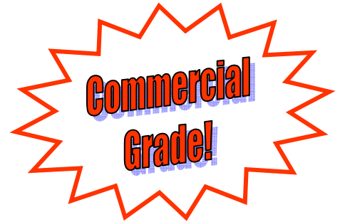
Commercial Grade Plows for Polaris Ranger®