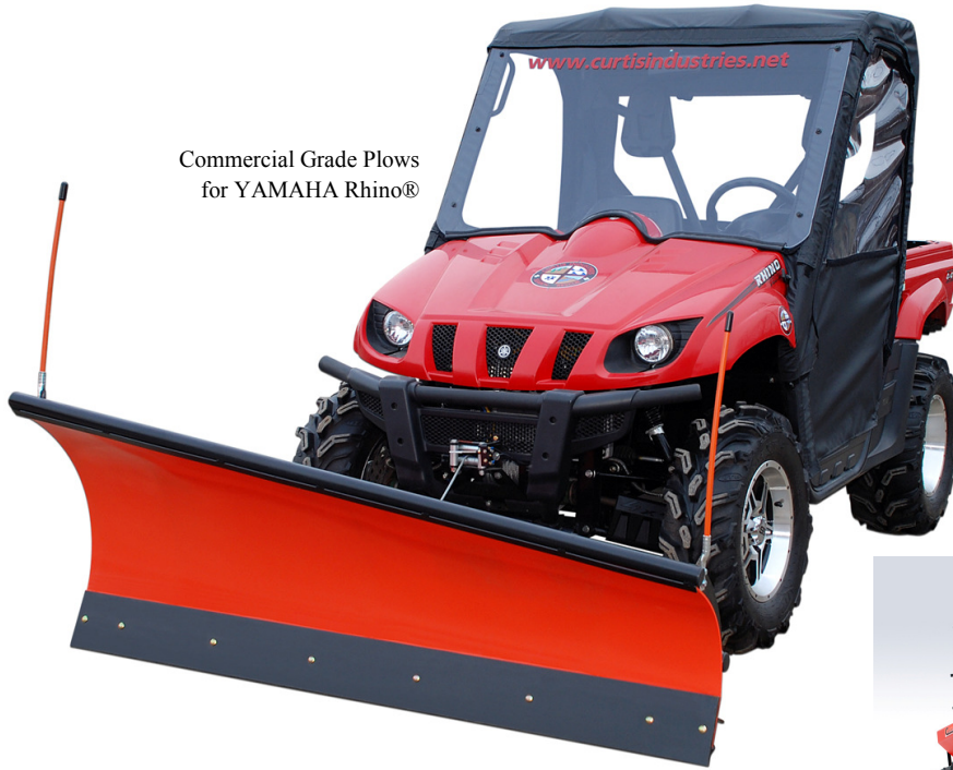
Commercial Grade Plows for YAMAHA Rhino®