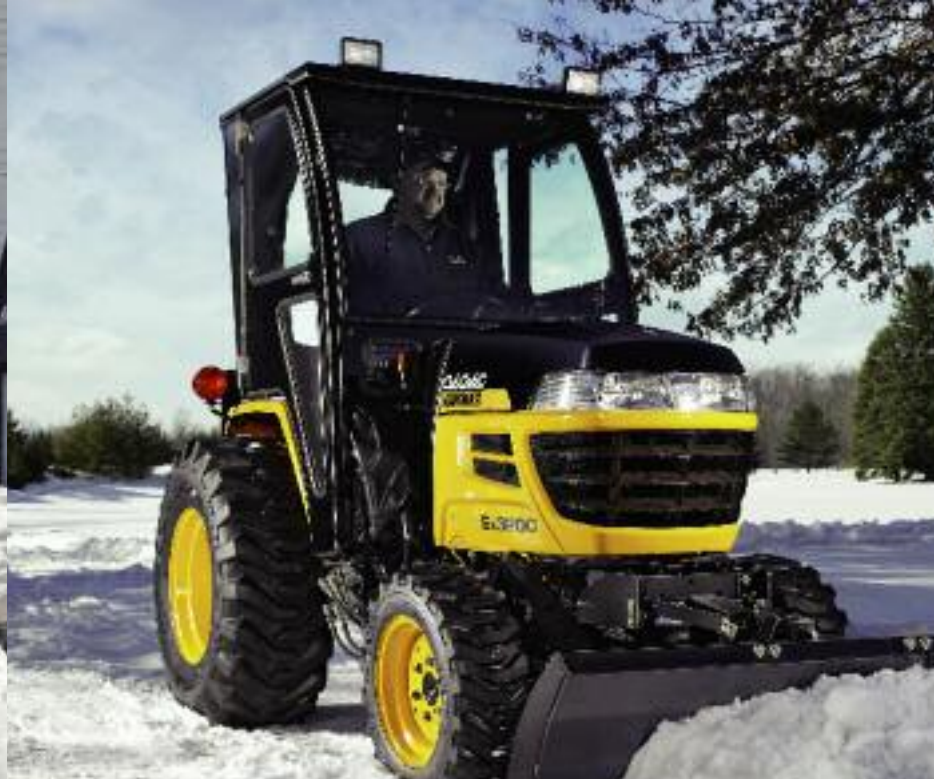
WorkPro Cab System Ex2900/3200 Series