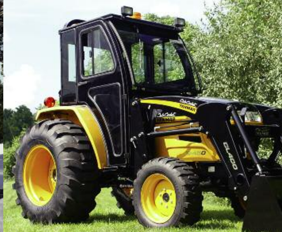
WorkPro Cab System Ex450 Series