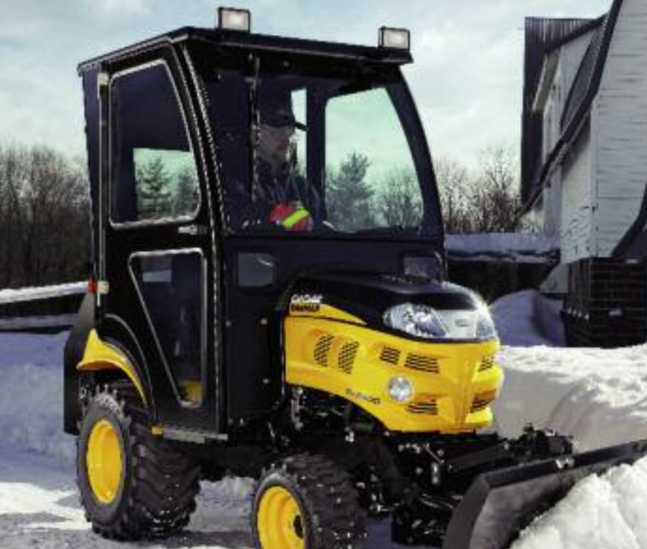
WorkPro Cab System Sc2400 Series