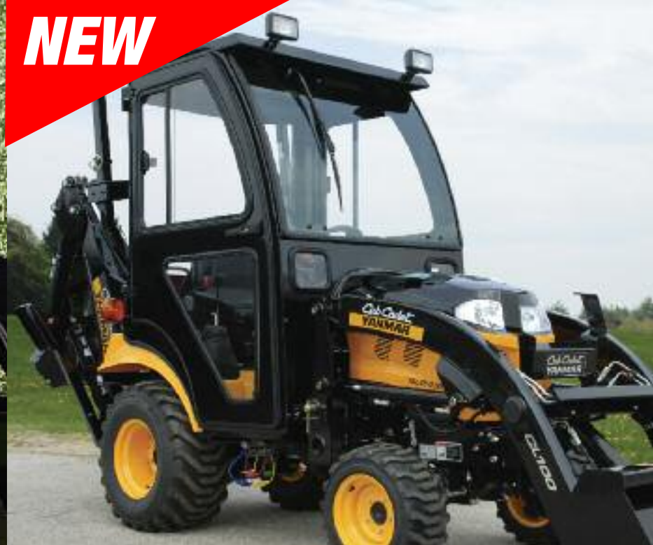
WorkPro Cab System Sc2450 TLB Series