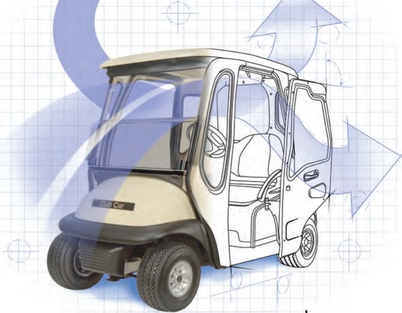
Open Air Ride!