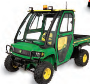
Utility Vehicle Cabs