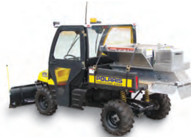
Utility Vehicle Snowplows and Spreaders