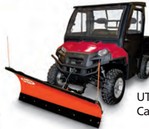
UTV and Side X Side Vehicle Cabs and Snowplows