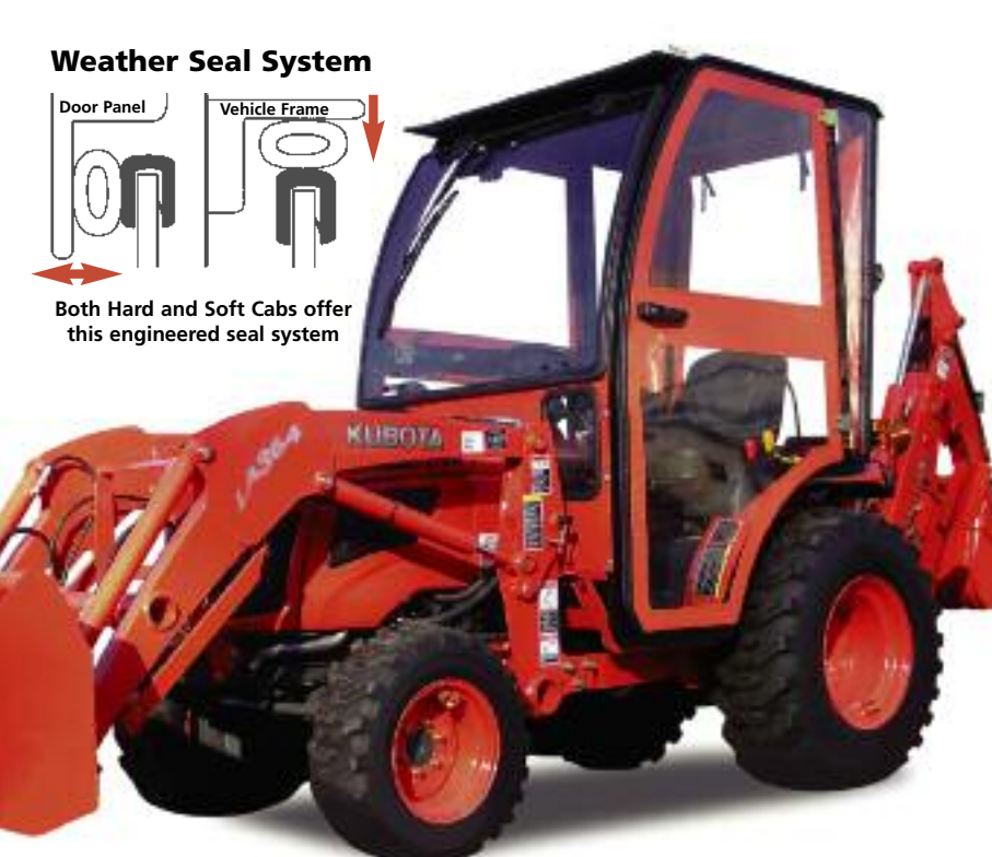
Both Hard and Soft Cabs offer this engineered seal system