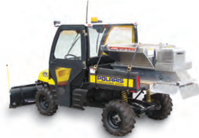
Utility Vehicle Snowplows and Spreaders