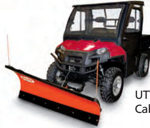
UTV and Side X Side Vehicle Cabs and Snowplows