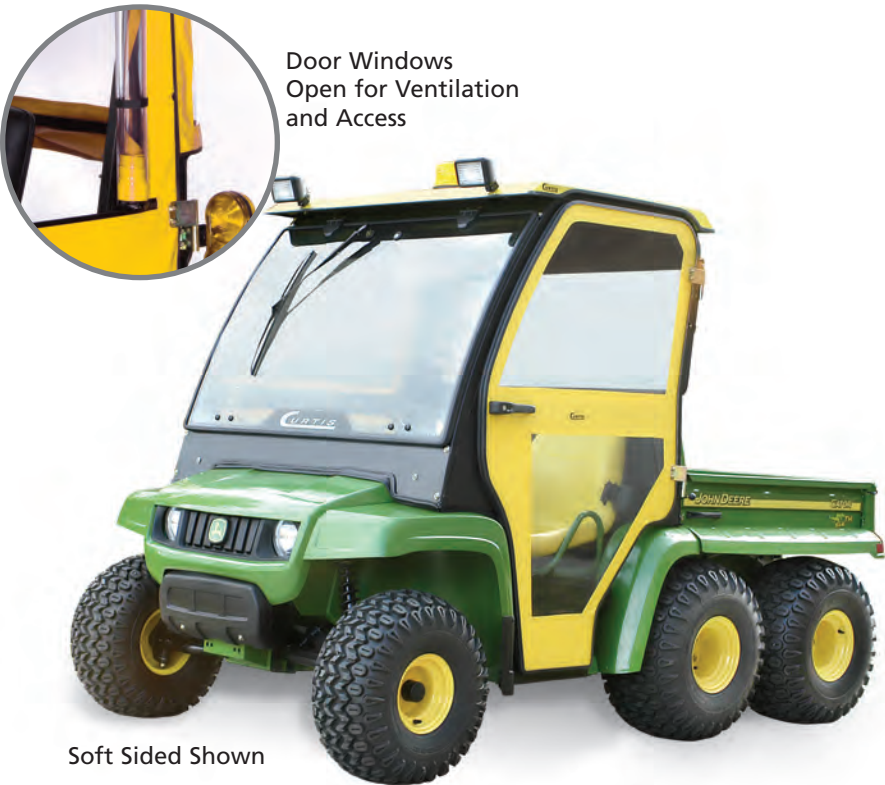
Soft Sided Shown